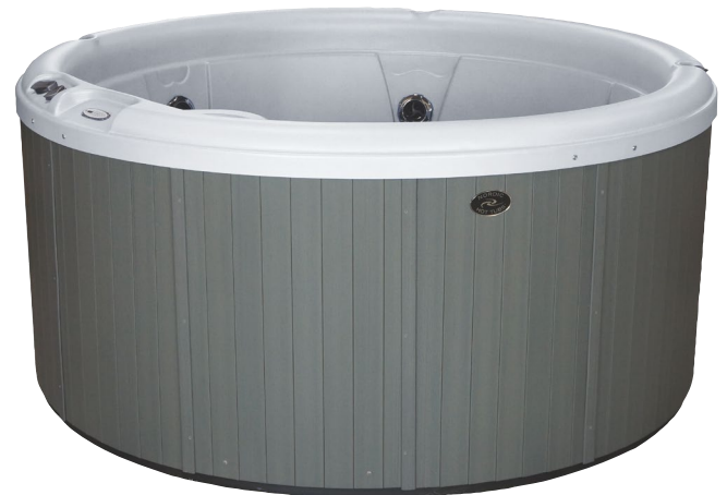
Shell: White | Cabinet: Charcoal